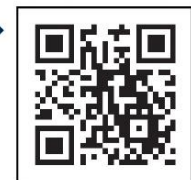
COVID-19 Vaccine Navi secondary code